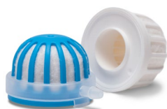
Figure 2. ProTrach® XtraCare™ HME, shown with and without O2 Adaptor

The integrated electrostatic filter provides filtration irrespective of the direction of the airflow and therefore provides the patient with humidification and filtration upon inspiration whilst also protecting others around them during expiration. Bacterial and Viral Filtration Efficiency is >99% (6, 7).